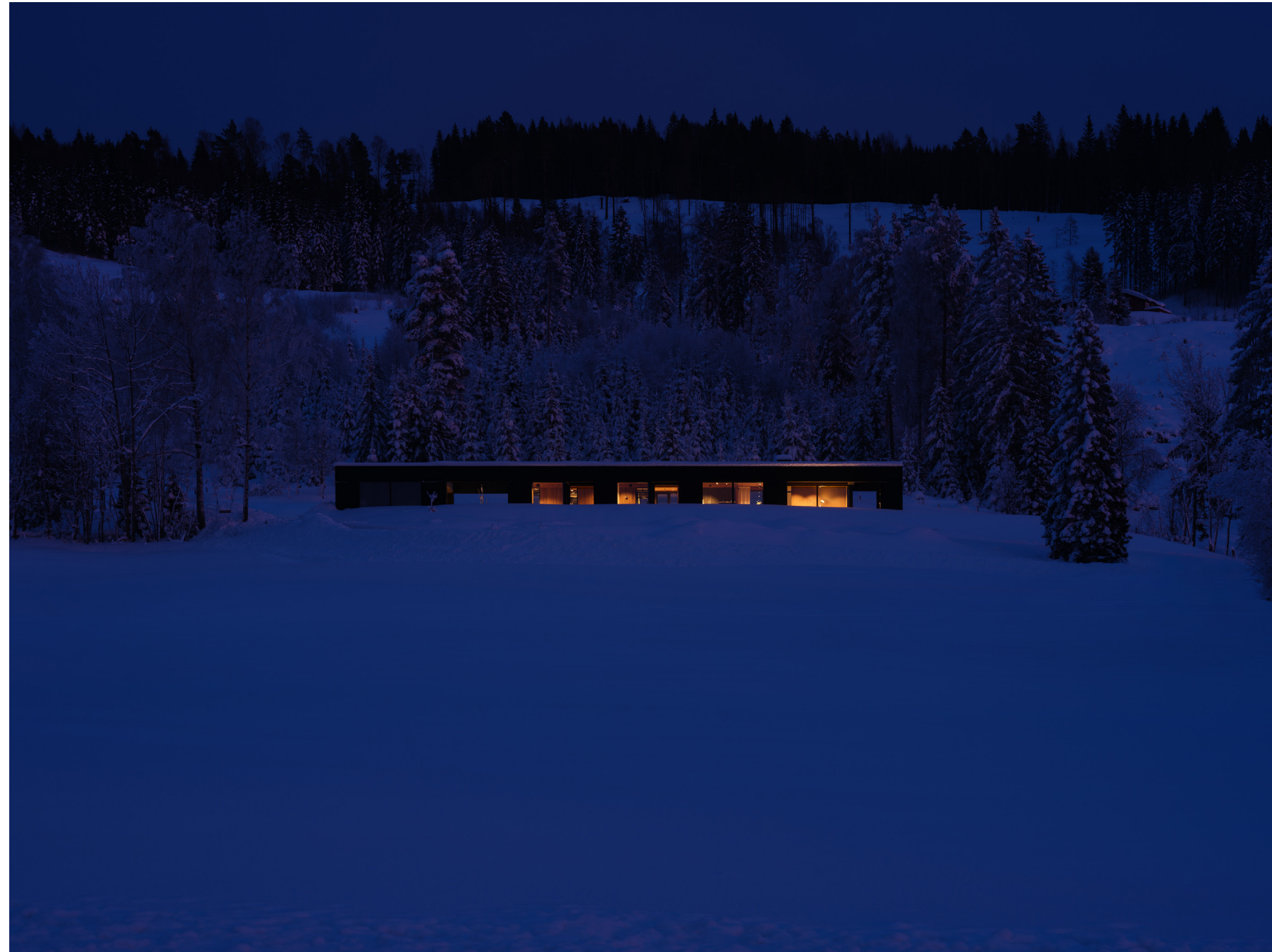
Villa Ringerike Dyvik & Fasting Arkitekter