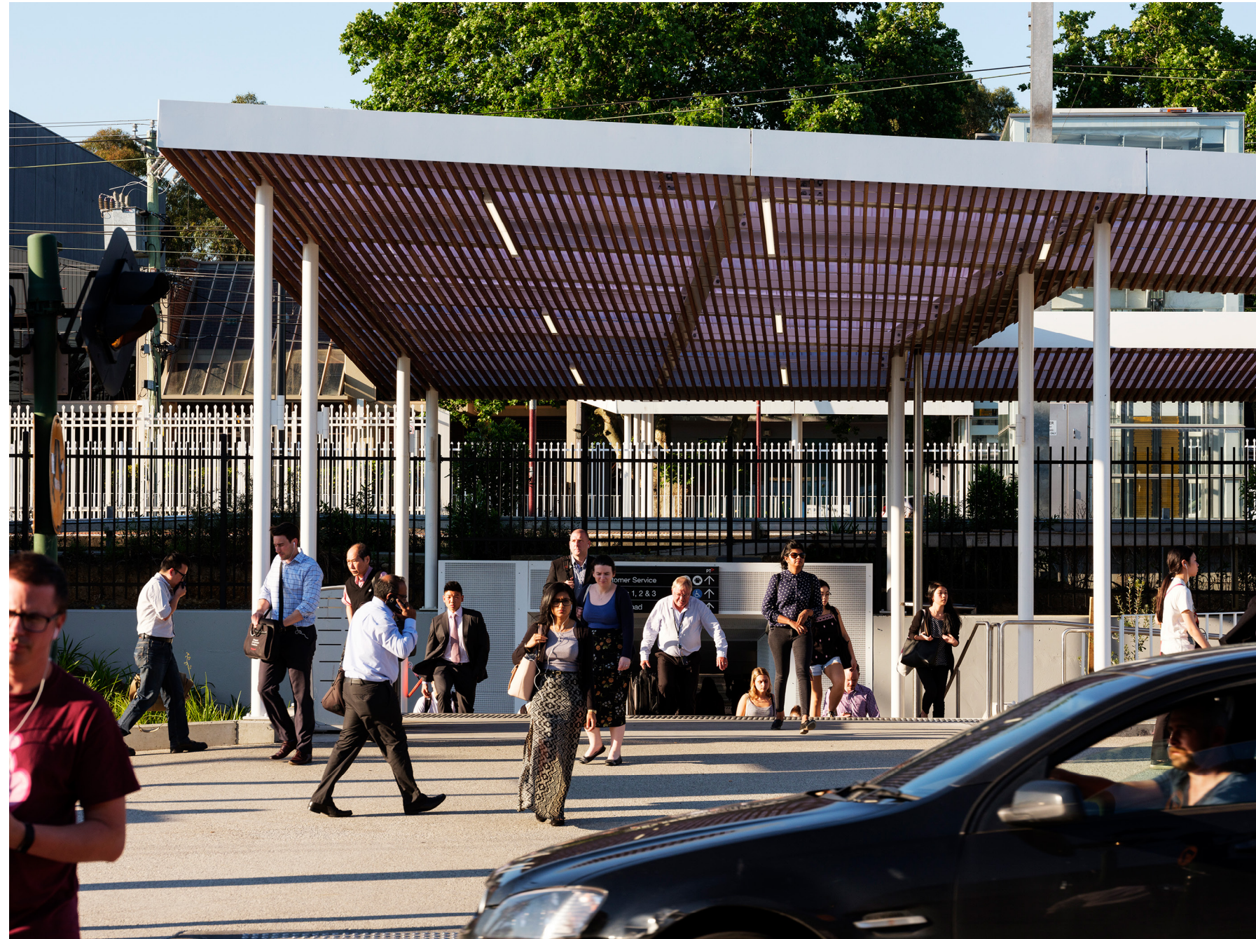
Blackburn Station Hassell