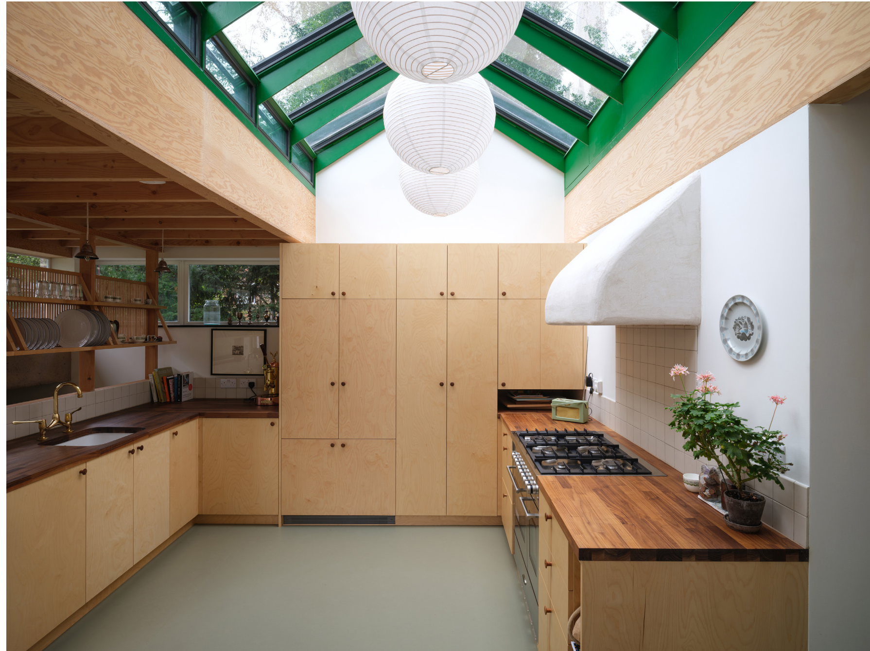
St.Anne's Close Hayatsu Architects