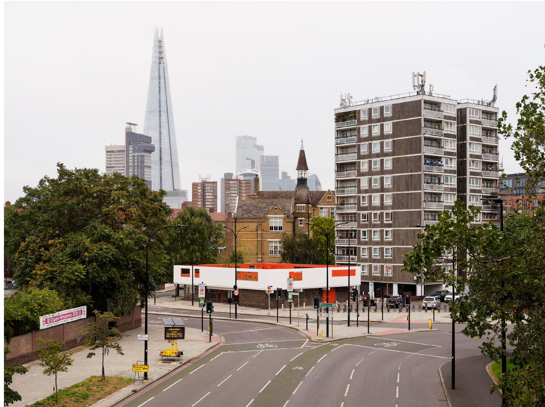
Peveril Gardens Sanchez Benton architects