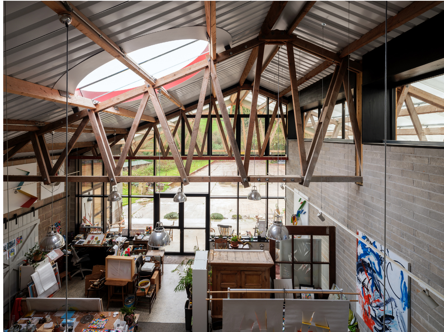
Cowshed David Kohn Architects