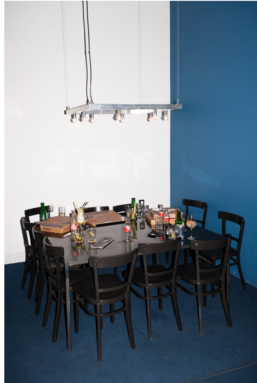
Manabar Weyell Zipse