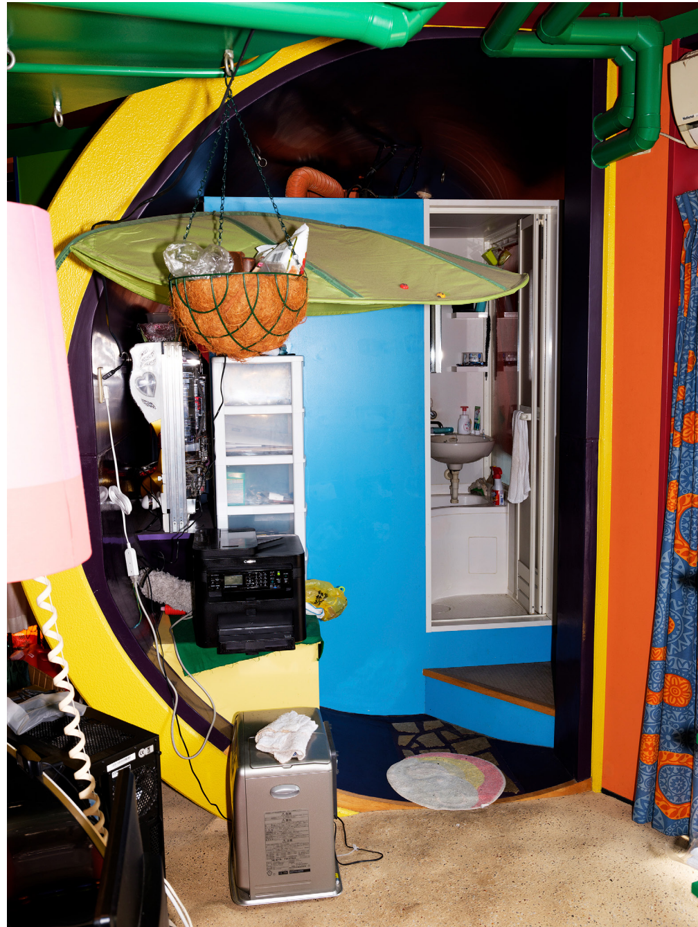
Reversible Destiny Lofts Arakawa and Gins