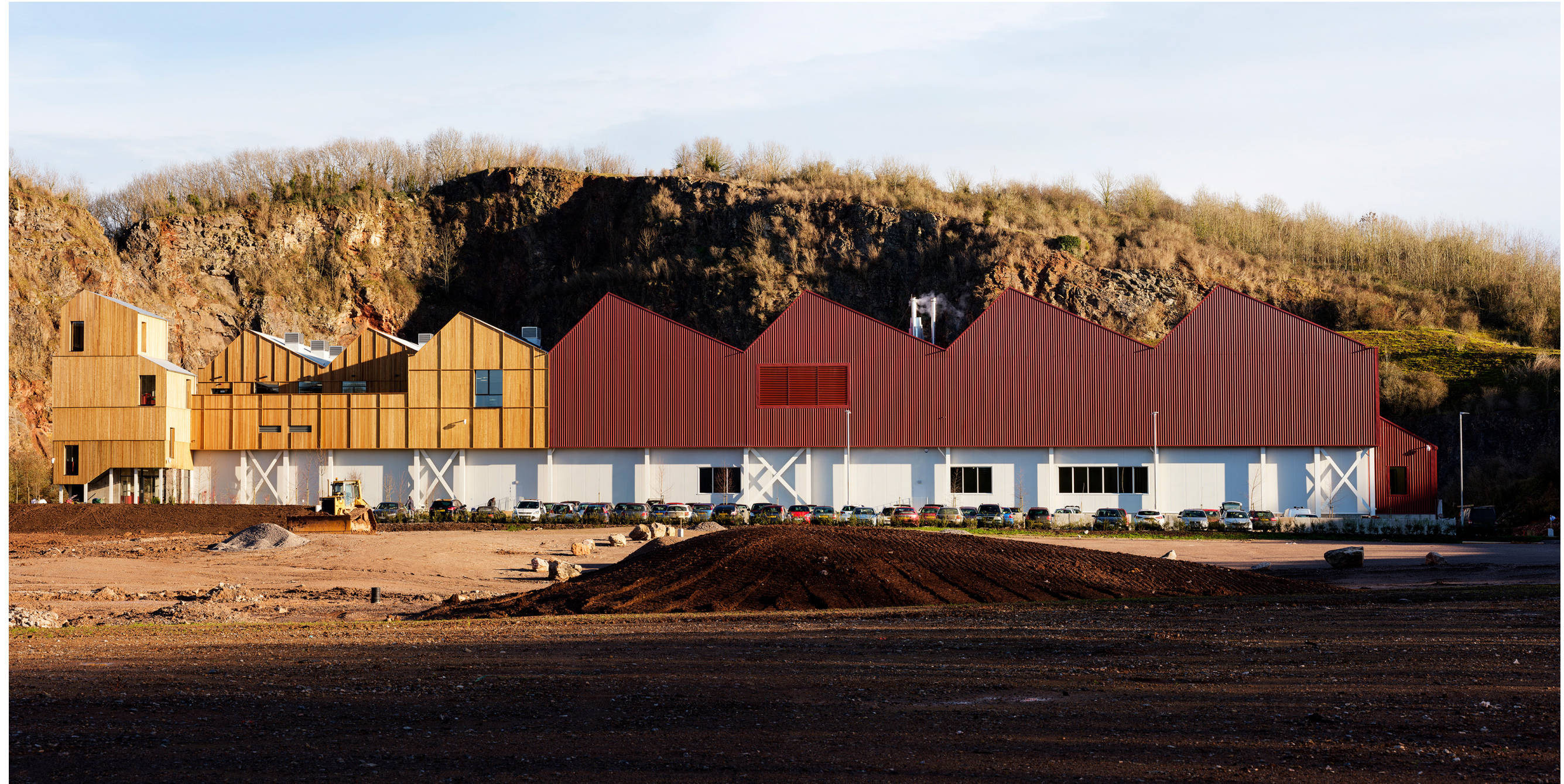
Charlie Bigham's Food Production Campus Feilden Fowles