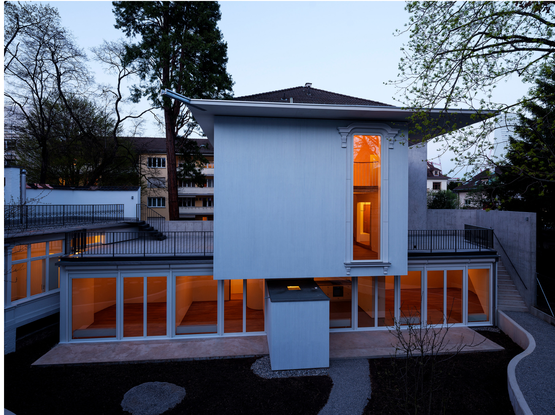
Villa Hammer Sauter von Moos