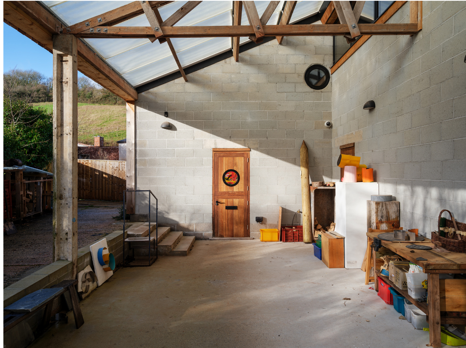
Cowshed David Kohn Architects