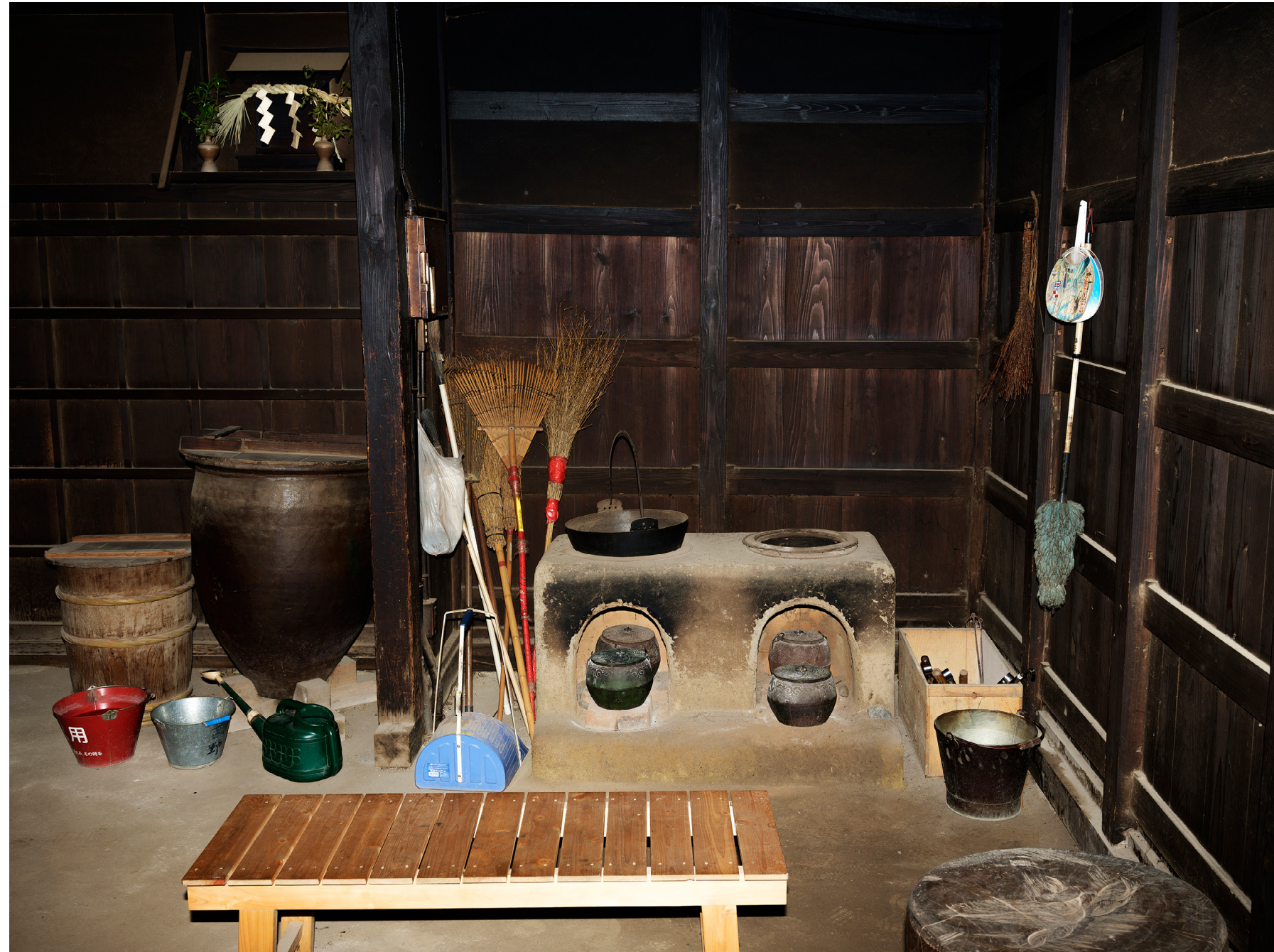
Farmhouse of the Tsunashima Family