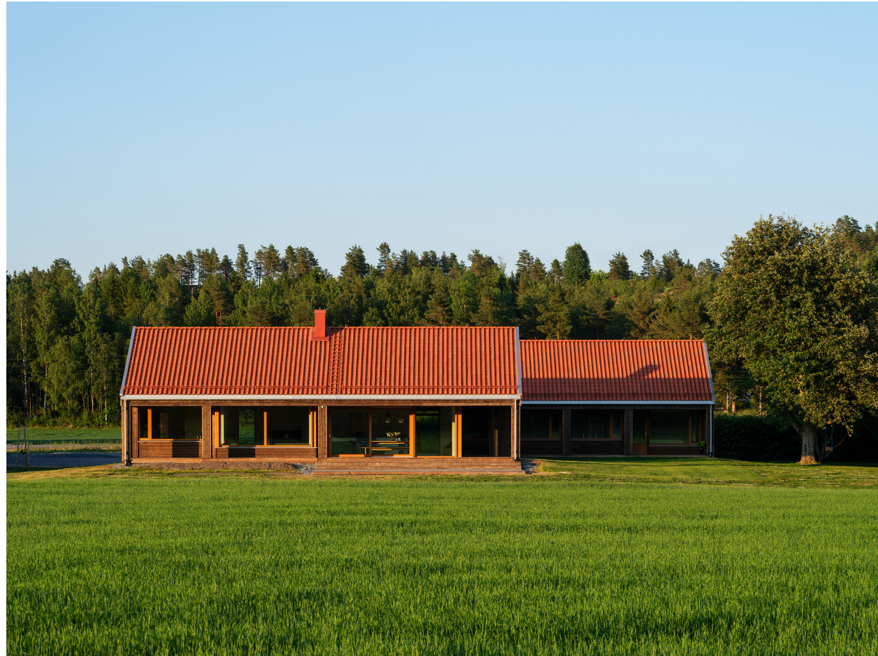
Villa Hvam Dyvik & Fasting Arkitekter