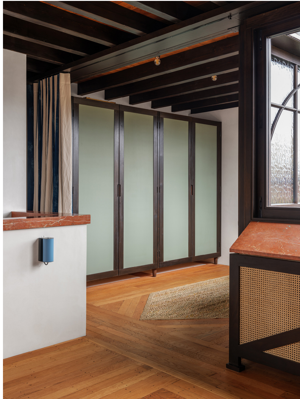
Madina View George Bunkall Architects