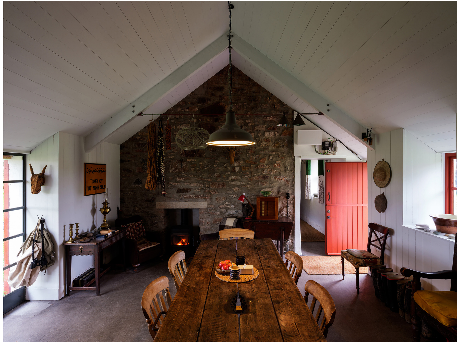
House in Wales