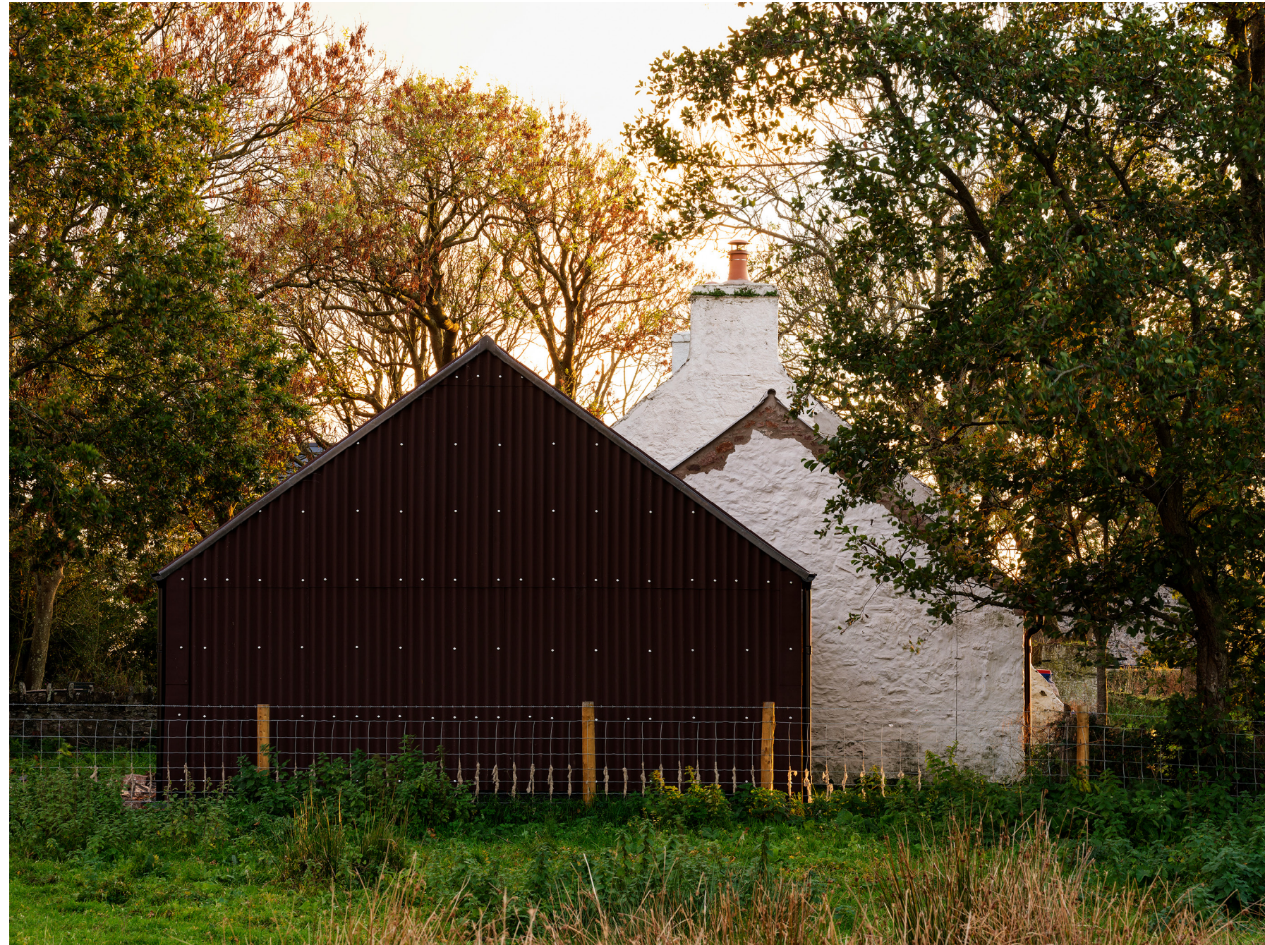
House in Wales Martin Edwards Architects