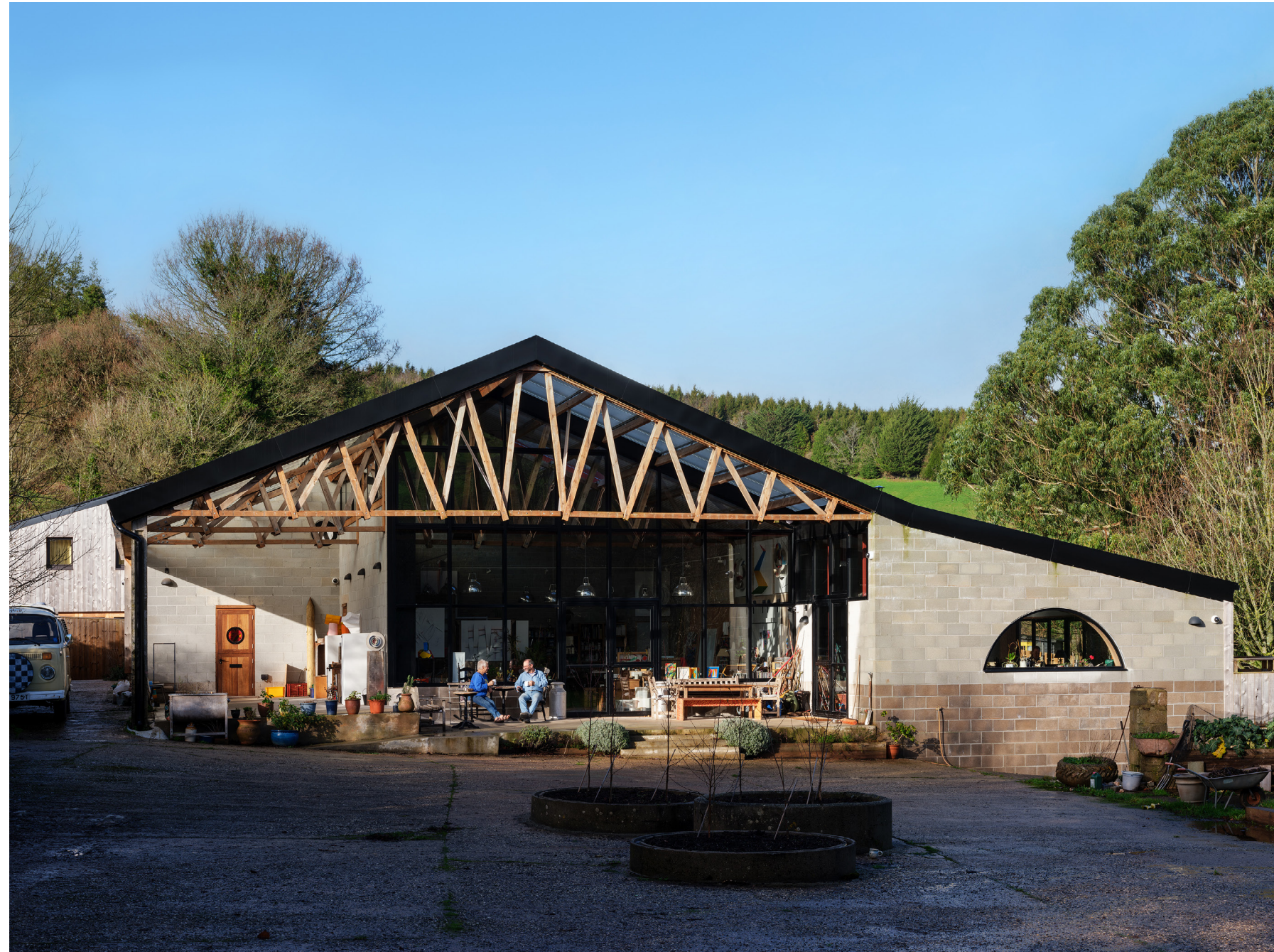
Cowshed David Kohn Architects