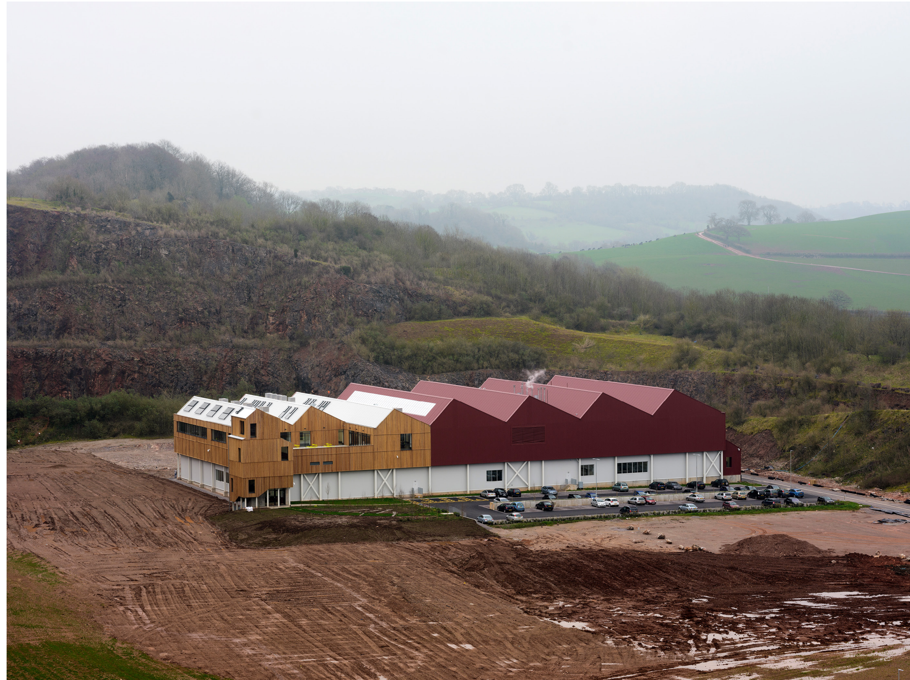
Charlie Bigham's Food Production Campus Feilden Fowles