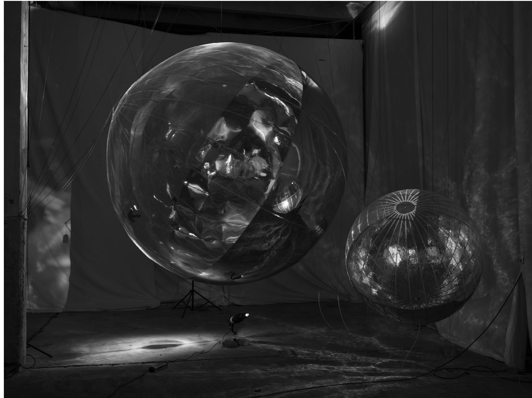
Tomas Saraceno Wallpaper*