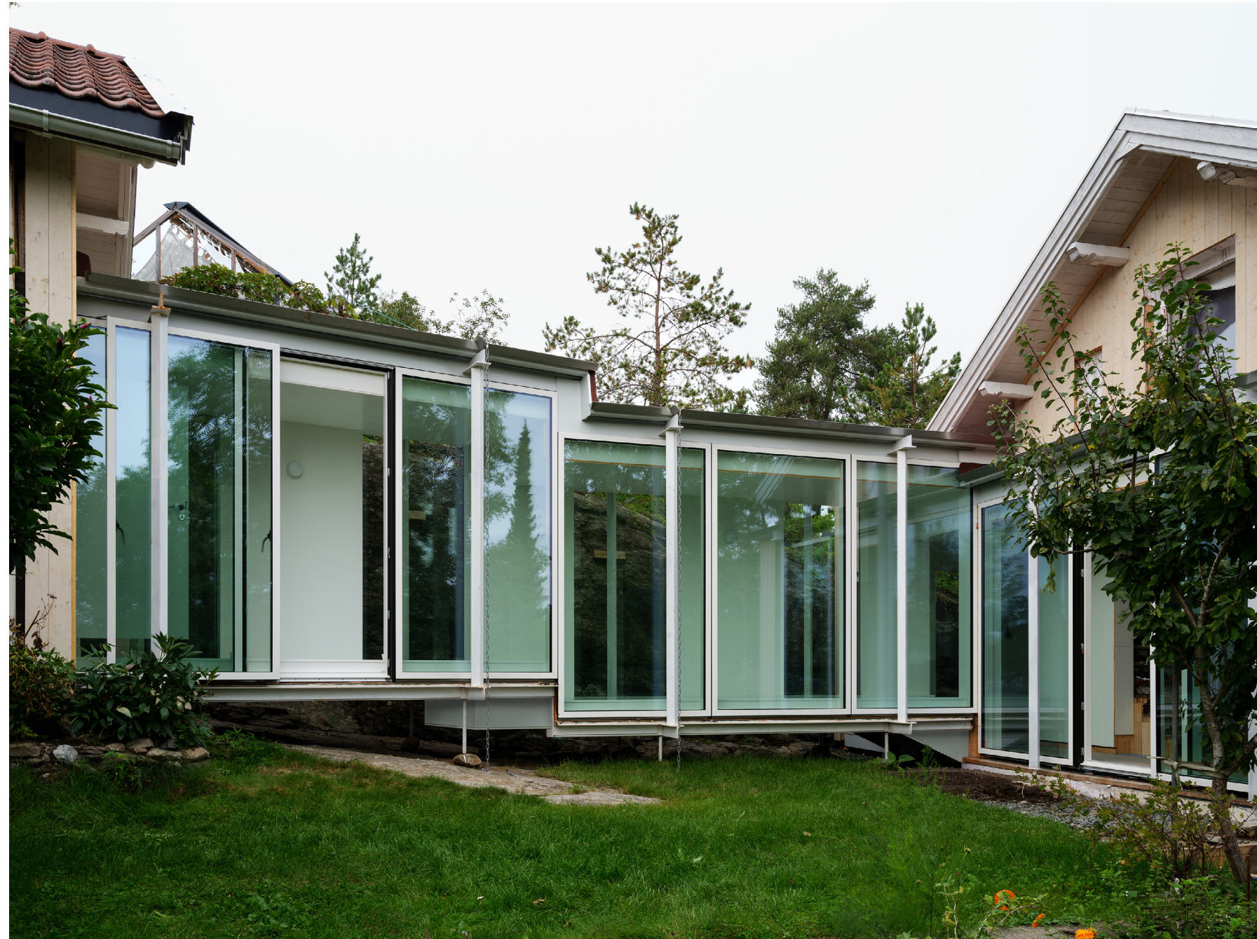
Link House Kastler Skjeseth Architects